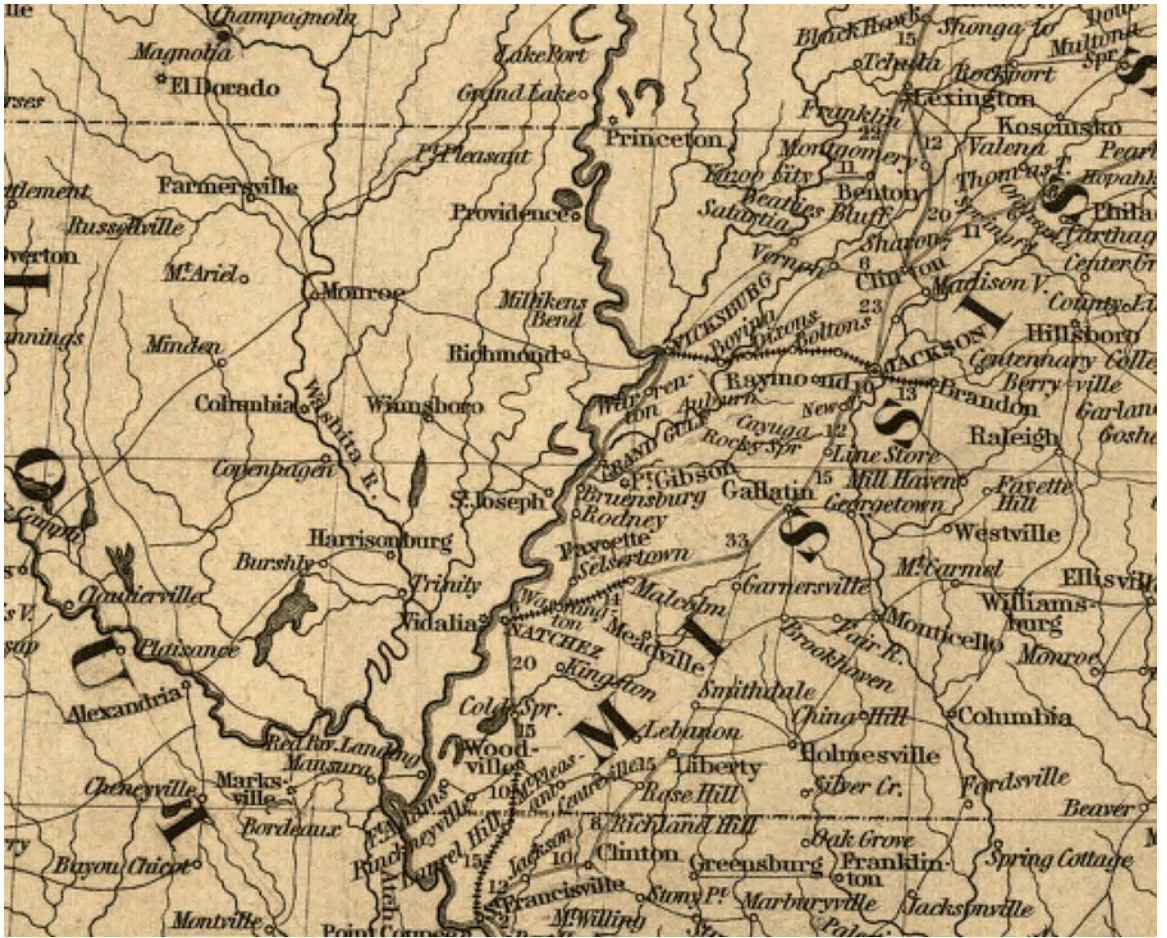
Bullock Summary Nauvoo Salt Lake City 1848